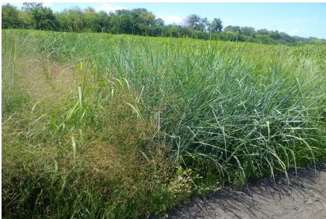
Fig. 1: Experimental plots of switchgrass.

The program envisages the research of the effect of biological peculiarities of a switchgrass genotype on the formation of its seed quality. The research was conducted at the Institute of bio-energy crops and sugar beets of NAAS and Yaltushkiv experimental-breeding station of IBCSB of NAAS in the years of 2018-2019. The cultivars of various maturation groups were used in the experiment: very early (Dacotah), early (Forestburg), average-early